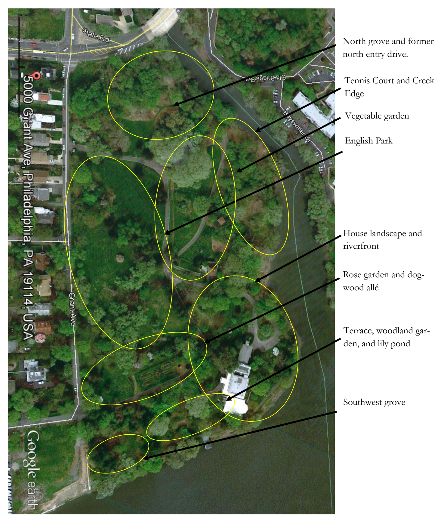
Principal landscape areas, Glen Foerd.