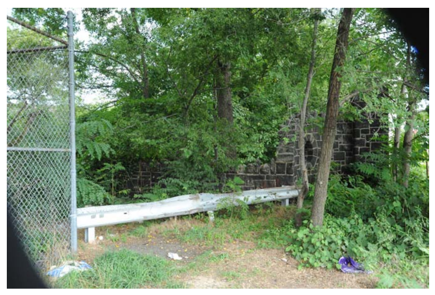
North and south entrance gates, looking from Grant Avenue, and remaining half of north gate, 2014.