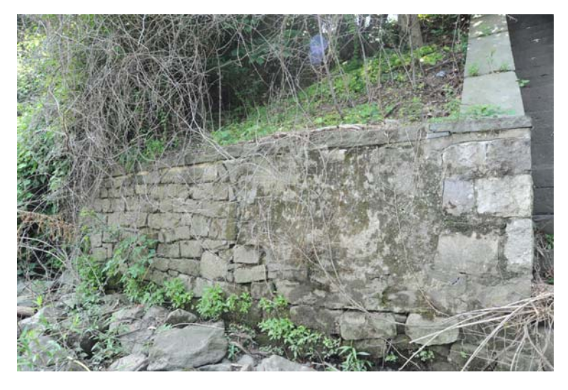
Entrance stairs from the Delaware River, and retaining wall, 2013 and 2014.