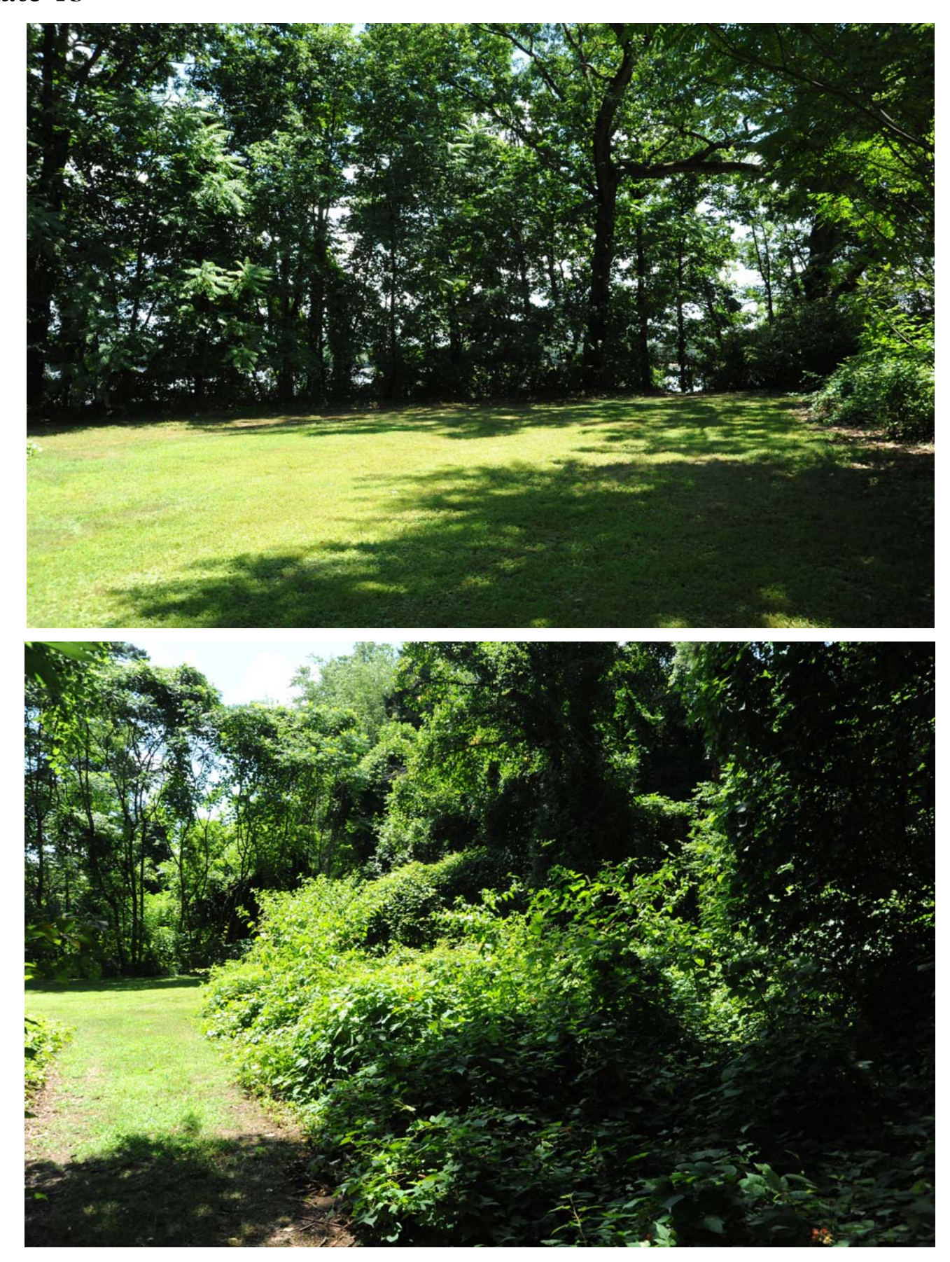
South grove, 2014.