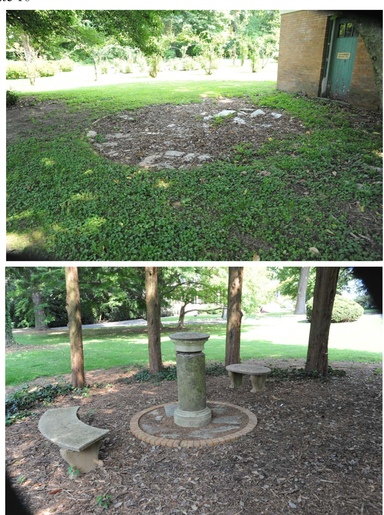
Remains of garden house terrace and historic pedestal and benches, 2014.