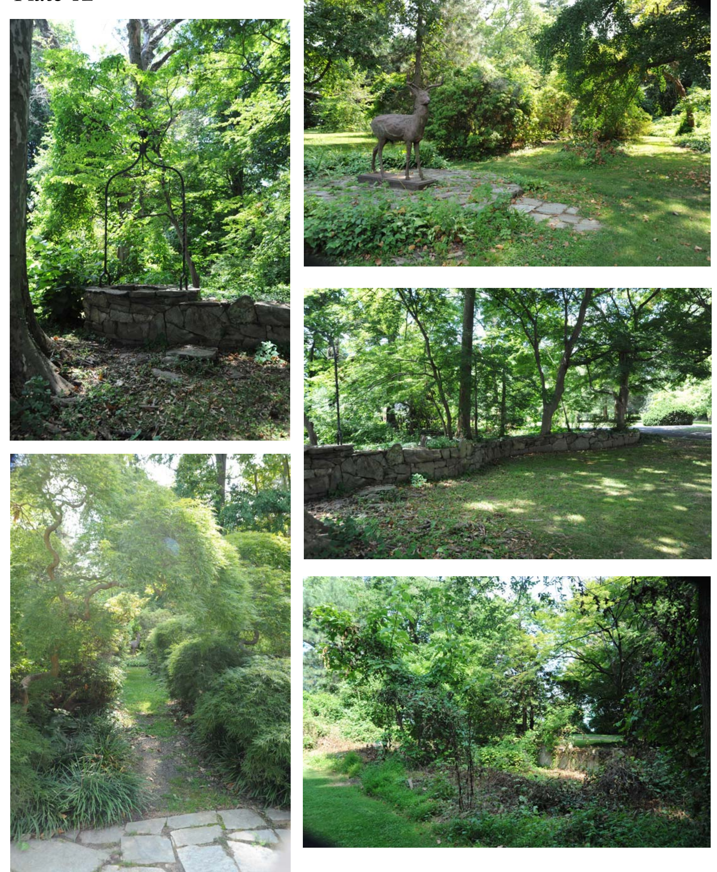
Details, woodland walk and lily pond, 2014.