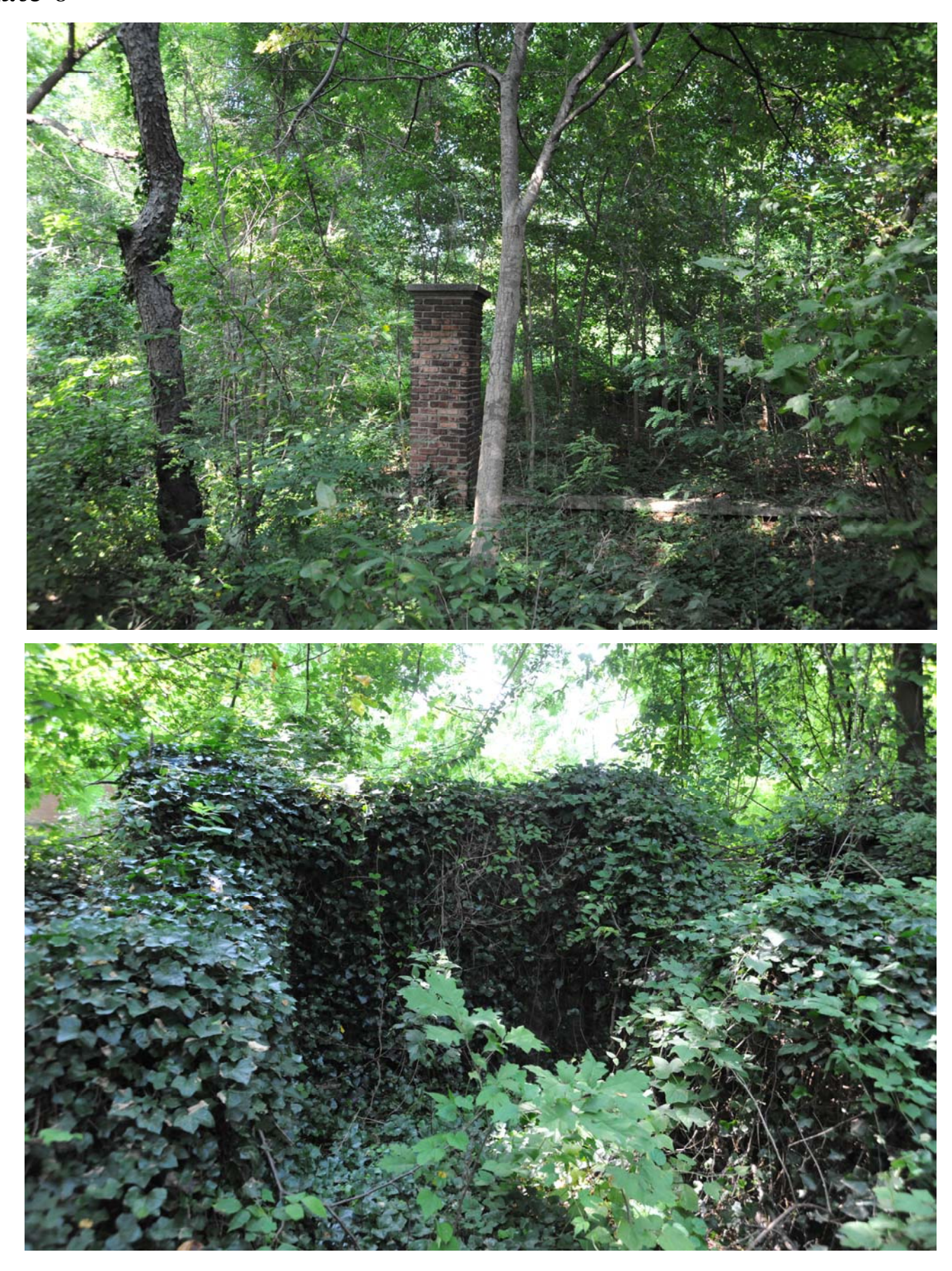
Tennis court area and decorative niche or fountain, 2014.