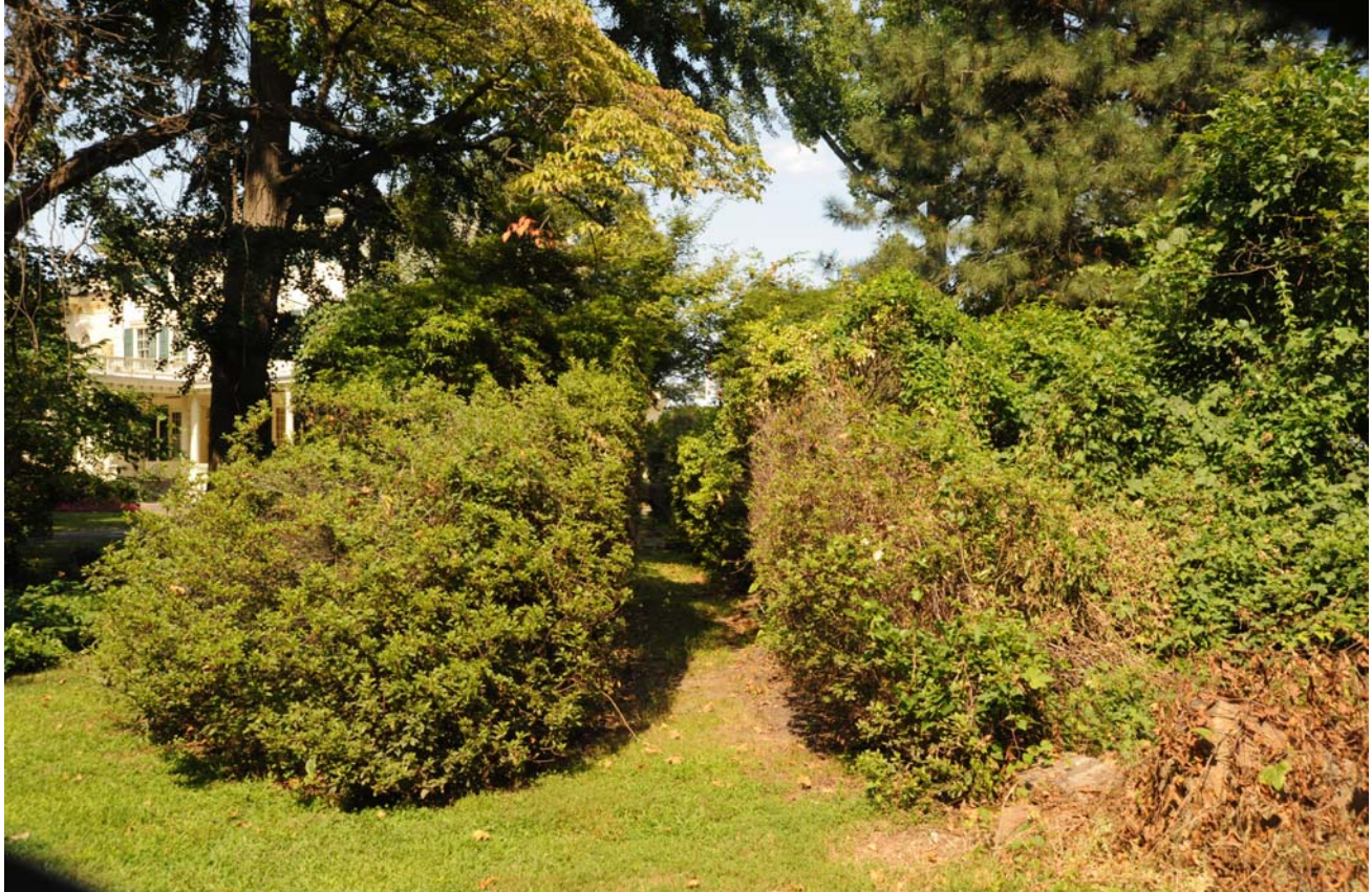
North and south entrance gates, looking southeast from Grant Avenue, 2014.