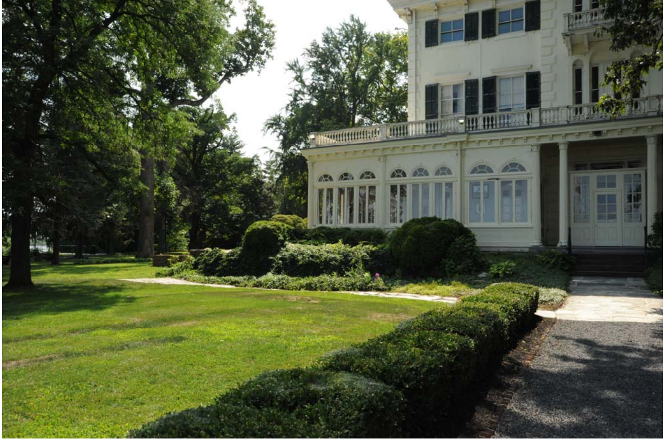
Main house and adjacent areas, 2014.