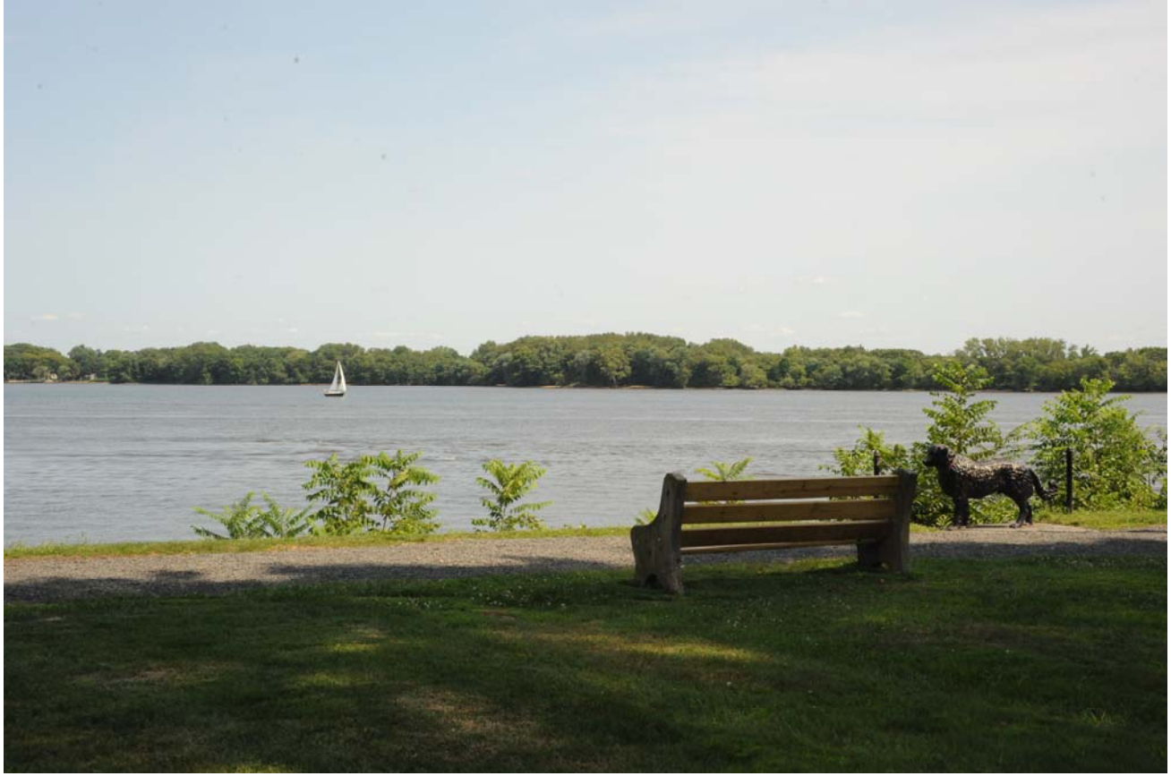
Gazebo, event tent, and Little Ugly statue, 2014.