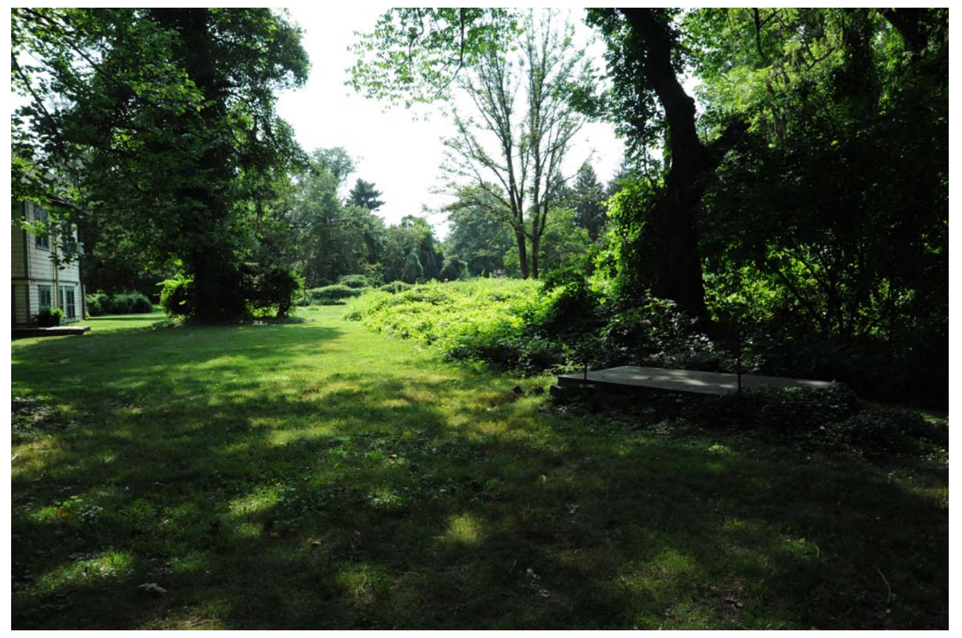
Service zone, showing remaining gate or arbor, cold frame base, and Maclester family crypt, 2013 and 2014.