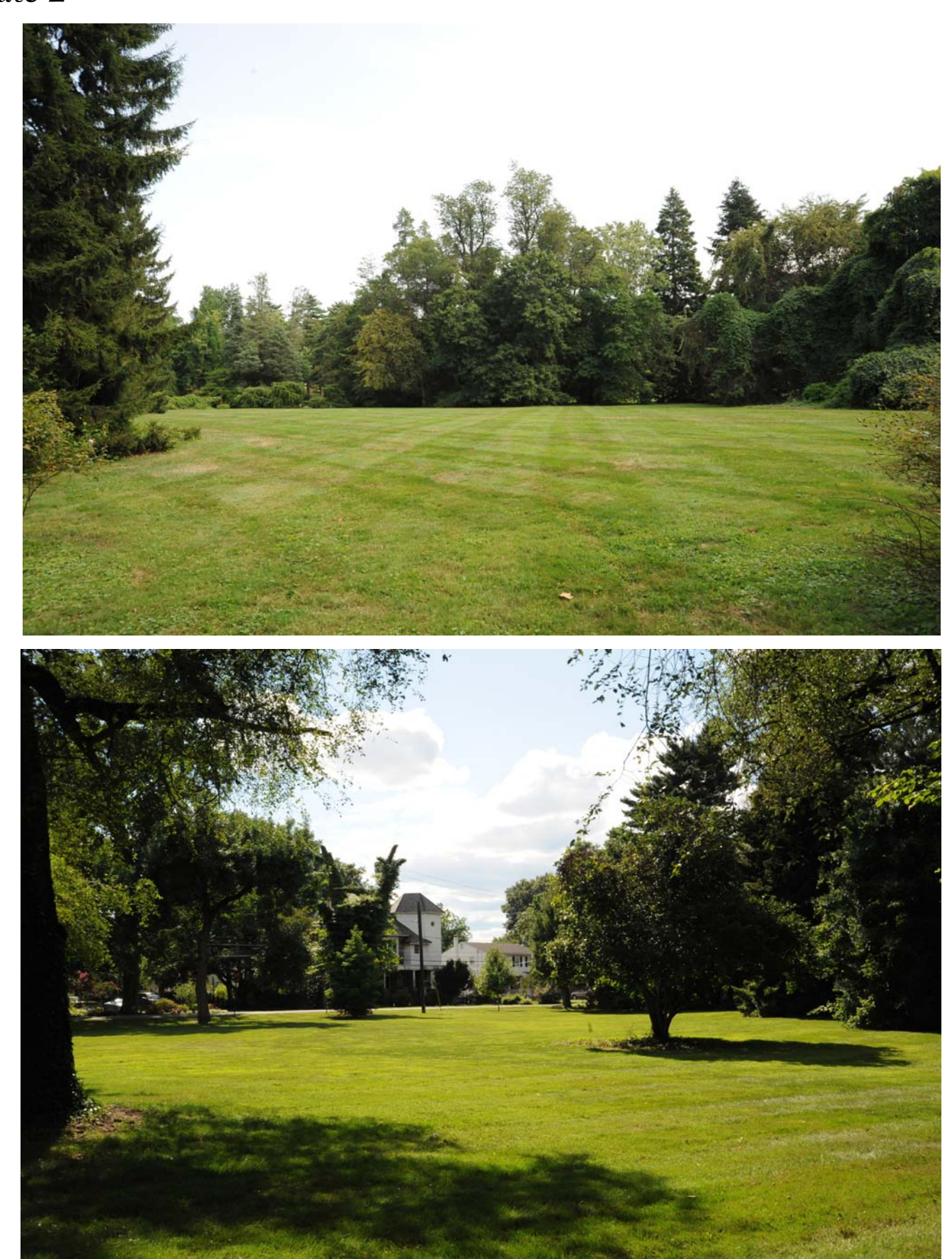
English park area, 2014.