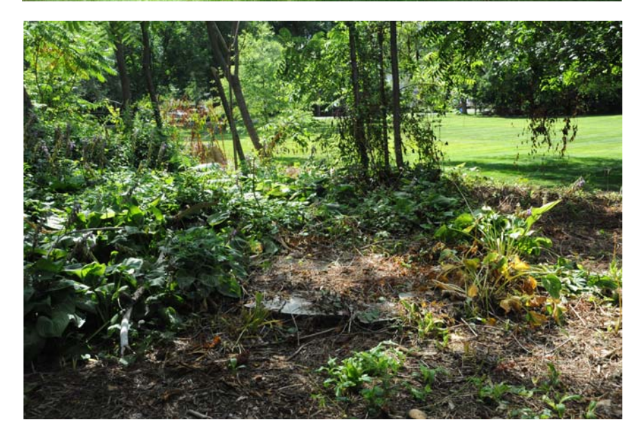
English park area details, 2014. Photographs: E. Cooperman.