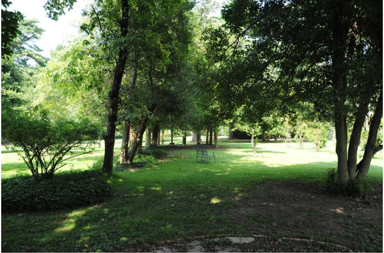
Rose garden and dogwood allée, 2014.